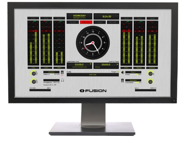
The main view