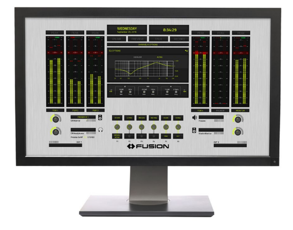
Channel EQ view with VU meter ballistics shown