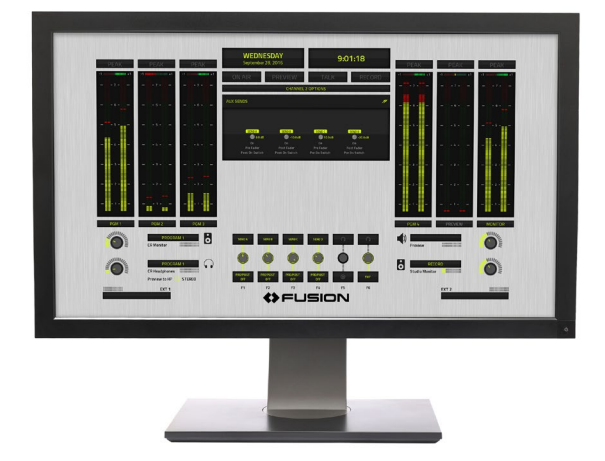
AUX SEND view with BBC PPM ballistics shown on meters